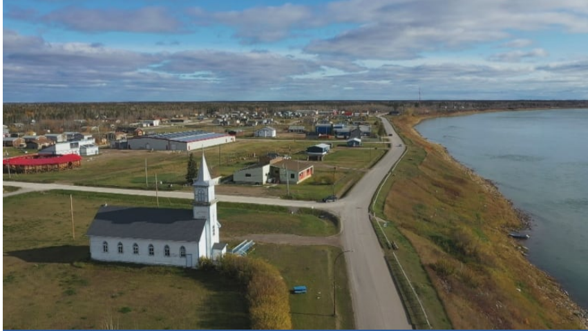
Fort Providence, NWT